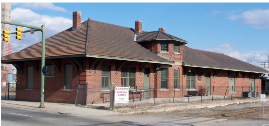
Richmond Railroad Museum